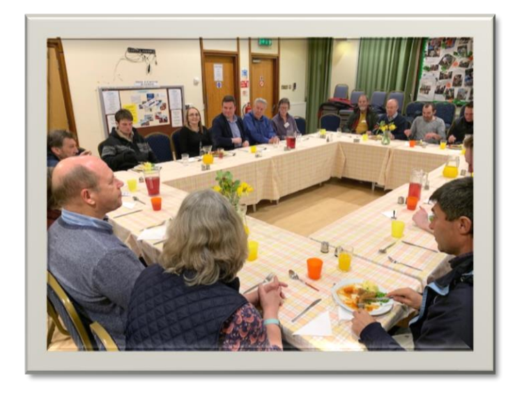
Guests and volunteers enjoy their meal