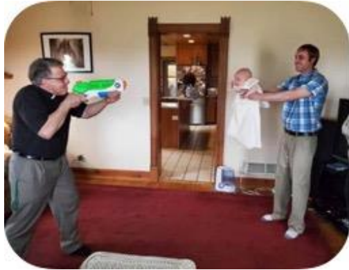
A Social distance baptism? and...